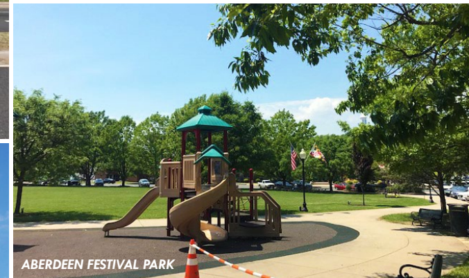
ABERDEEN FESTIVAL PARK