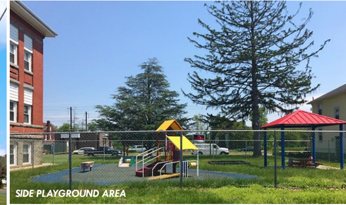
SIDE PLAYGROUND AREA