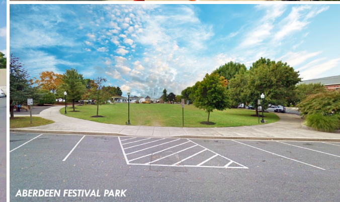
ABERDEEN FESTIVAL PARK