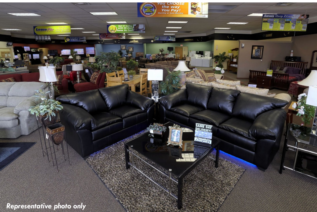
Representative photo only

This is a Confidential Memorandum intended solely for your own limited use to determine whether you wish to express interest in the property.