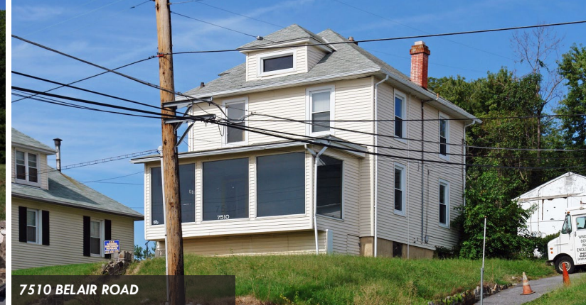
7510 BELAIR ROAD