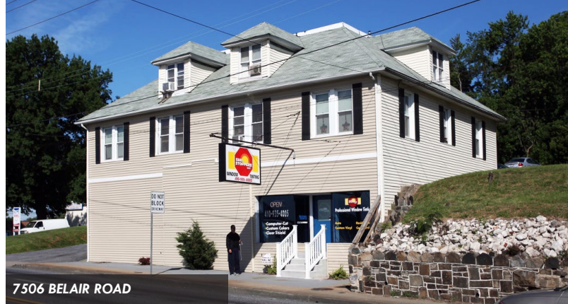
7506 BELAIR ROAD