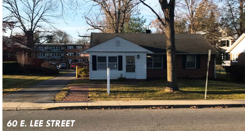
60 E. LEE STREET