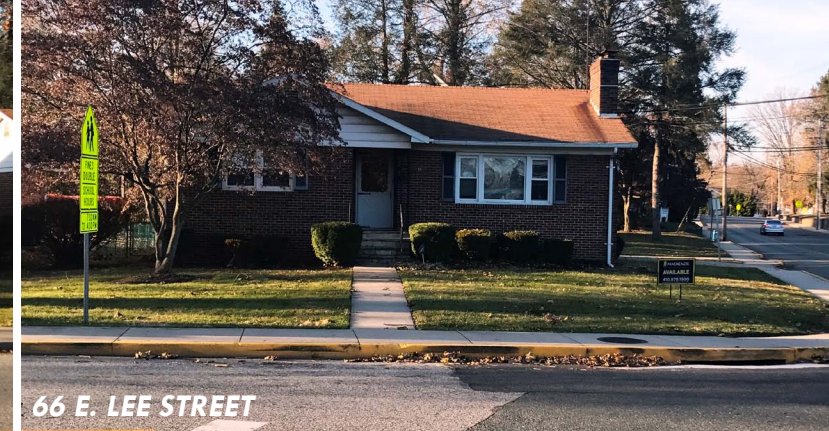
66 E. LEE STREET