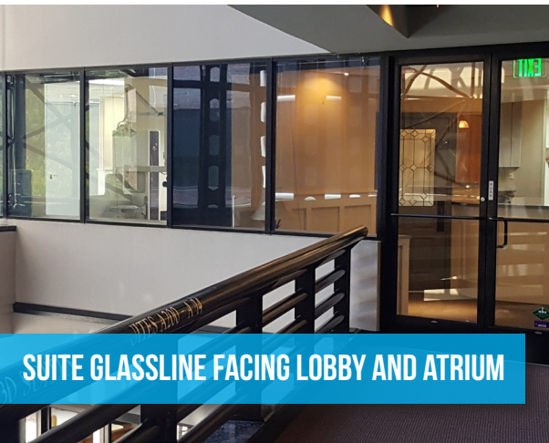
SUITE GLASSLINE FACING LOBBY AND ATRIUM

OMNI PROFESSIONAL BUILDING | 4000 MITCHELLVILLE ROAD | BOWIE, MARYLAND, 20716