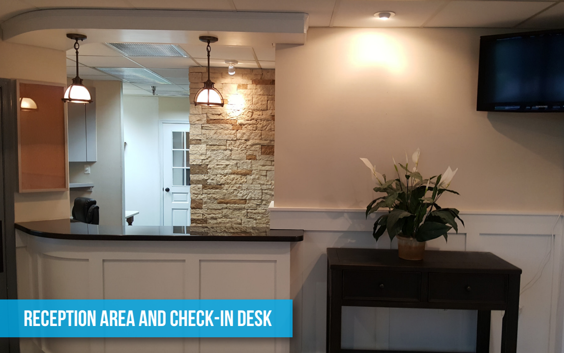
RECEPTION AREA AND CHECK-IN DESK