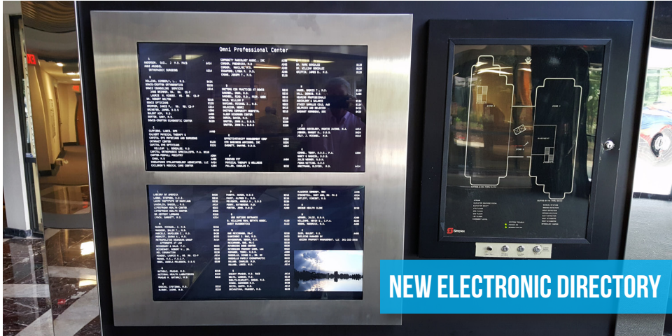
NEW ELECTRONIC DIRECTORY