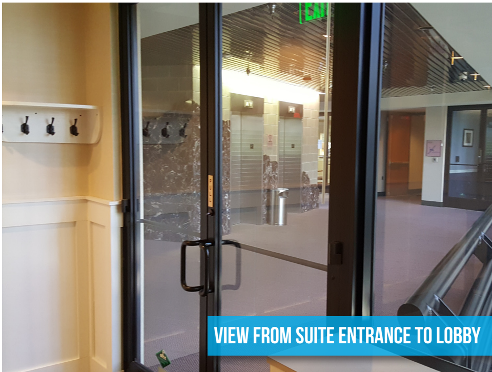
VIEW FROM SUITE ENTRANCE TO LOBBY