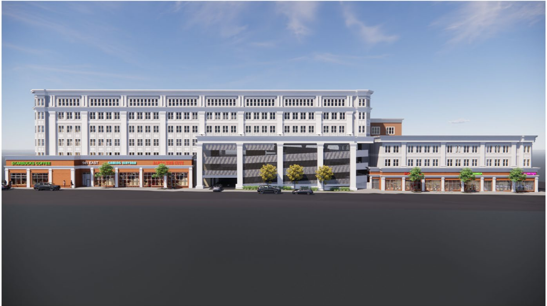
View at Haines Street

141B E. MAIN STREET | NEWARK, DELAWARE 19711