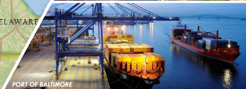
PORT OF BALTIMORE