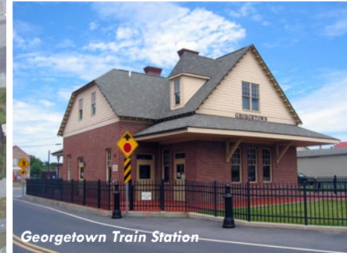
Georgetown Train Station