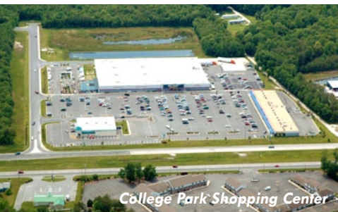
College Park Shopping Center

ROUTE 113 (DUPONT BLVD) & ROUTE 404 (SEASHORE HWY) | GEORGETOWN, DELAWARE 19947