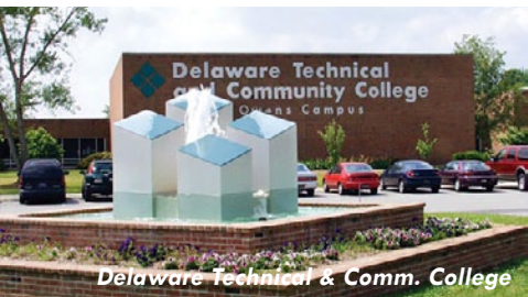
Delaware Technical & Comm. College