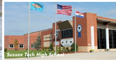
Sussex Tech High School