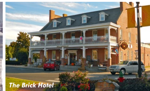
The Brick Hotel