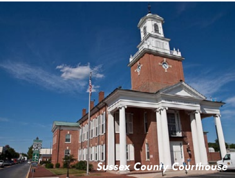
Sussex County Courthouse