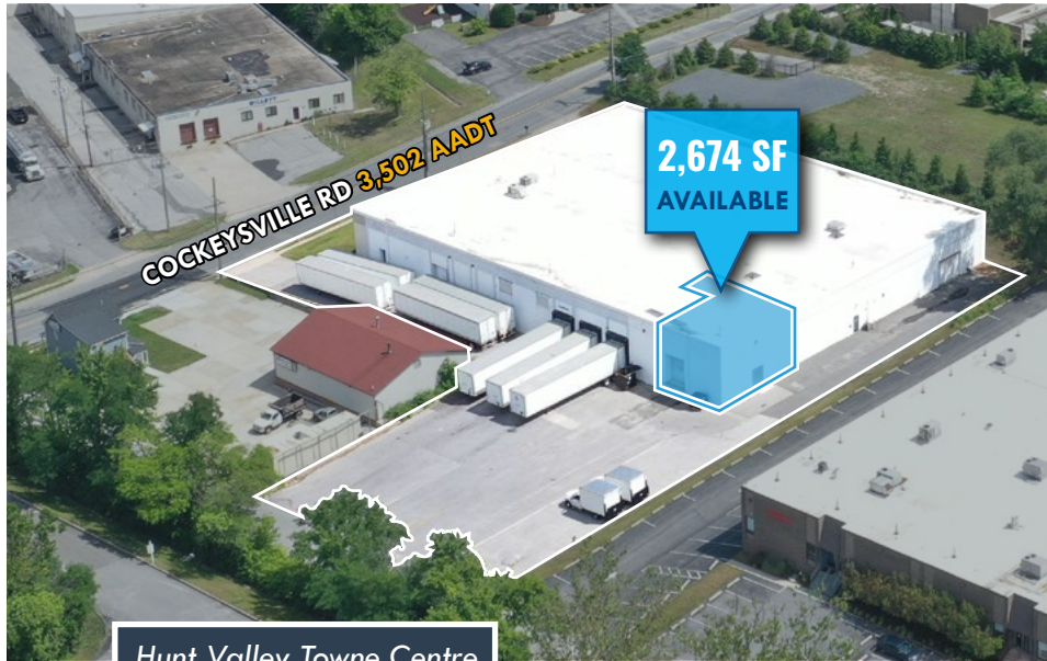
Hunt Valley Towne Centre