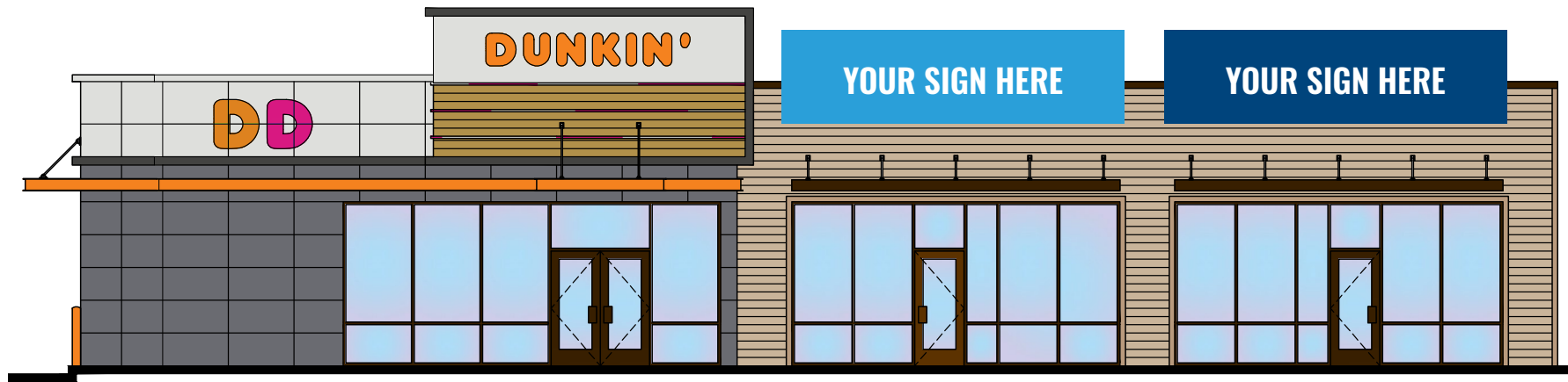
ELEVATION 1 1/4" = 1' - 0"