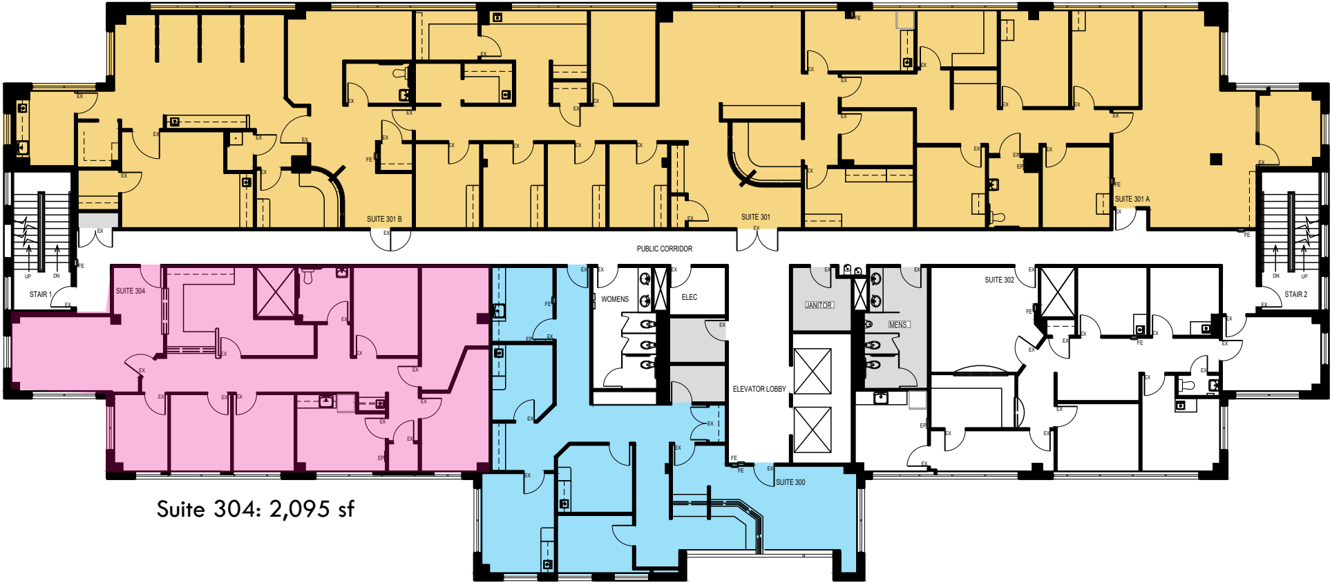
Suite 304: 2,095 sf