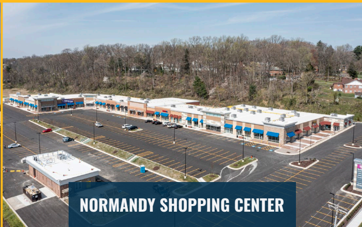
NORMANDY SHOPPING CENTER